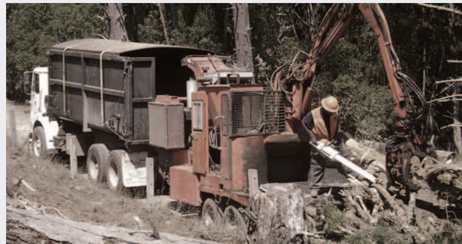
Tree removal activity and equipment.