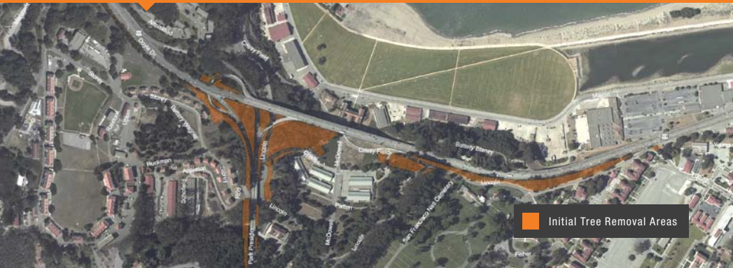
Initial Tree Removal Areas